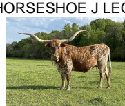
HORSESHOE J LEGIBLE