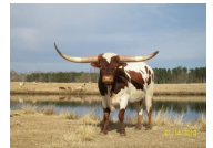
DEL RIO CHEX