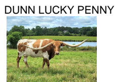
DUNN LUCKY PENNY