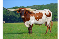
Hubbells Rio 007