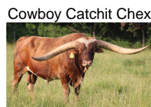
Cowboy Catchit Chex