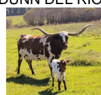
DUNN DEL RIO READY