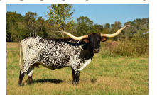
HORSESHOE J INTERJECT