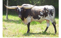
Horseshoe J Charm