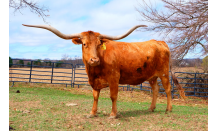
BL Coach's Desperado