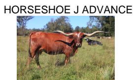
HORSESHOE J ADVANCE