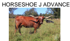
HORSESHOE J ADVANCE