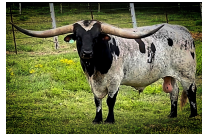
RJF LOCK & LOAD