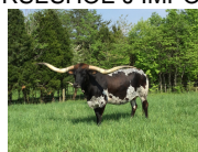
HORSESHOE J IMPORTANT