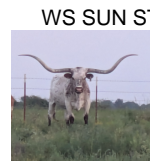
WS SUN STAR