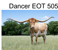
Dancer EOT 505