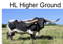
HL Higher Ground