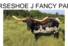
HORSESHOE J FANCY PANTS