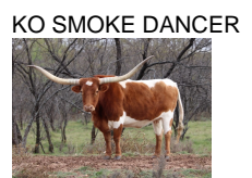
KO SMOKE DANCER