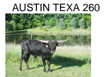
AUSTIN TEXA 260