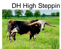
DH High Steppin