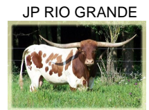
JP RIO GRANDE