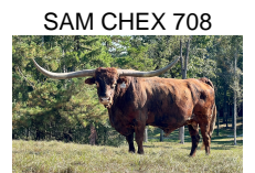
SAM CHEX 708