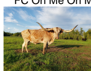
FC Oh Me Oh My