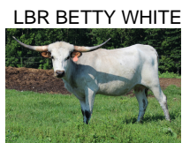
LBR BETTY WHITE