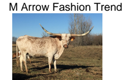
M Arrow Fashion Trend