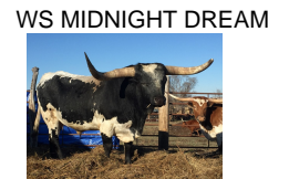
WS MIDNIGHT DREAM