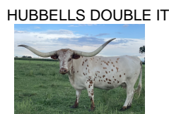
HUBBELLS DOUBLE IT