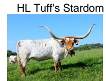
HL Tuff's Stardom