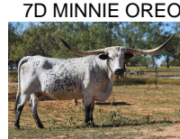
7D MINNIE OREO