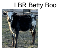
LBR Betty Boo