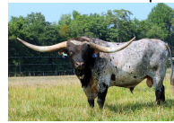
HL Heads Up