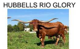
HUBBELLS RIO GLORY