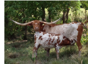
JESTEX VAN HORNE 9 CF12