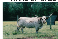
WAKE UP CALL