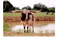
Field Of Pearls